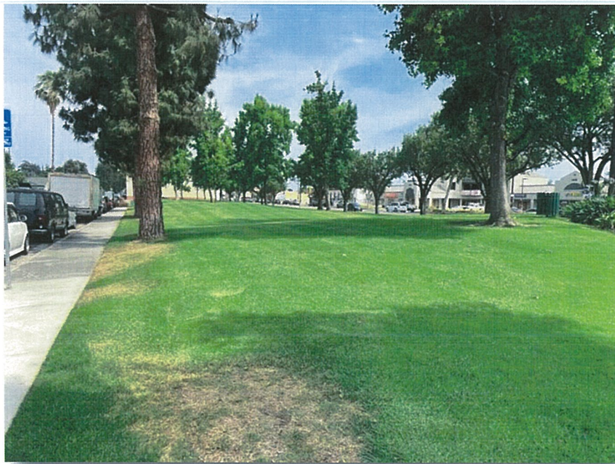
View looking East from Redman